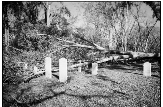
Tornado damage, The Shackelford Cemetery