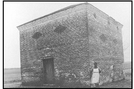
Stone family smokehouse, Old Selma Road