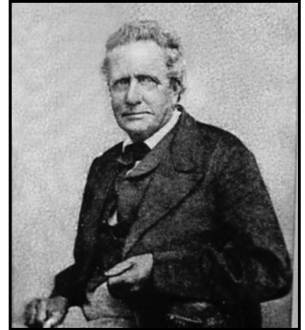
Barton Warren Stone; builder of Stone House Montgomery.

In 1849, the net profit from a single bale of cotton sold in Mobile, Alabama, was $51.00. This amount was equal in value to $1,059.64 in 2002. An accumulated wealth of $50,030.73 designated millionaire status in 1849. In 1862, millionaire status required a total wealth of $51,961.69.