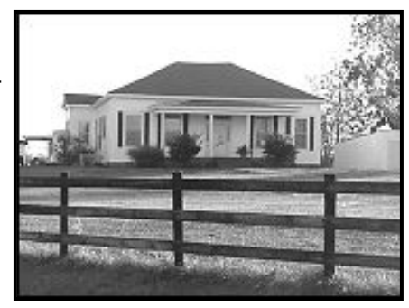
Watts plantation home in 2007